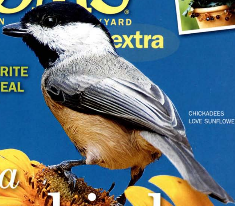
CHICKADEES LOVE SUNFLOWERS

AMERICA'S FAVORITE GARDENERS REVEAL THEIR secrets