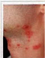
Actual photo of the Shingles rash.

The fact is, 1 in 3 people will get Shingles in their lifetime. The same virus that causes chickenpox also causes Shingles. And if you've ever had chickenpox, like 98% of adults