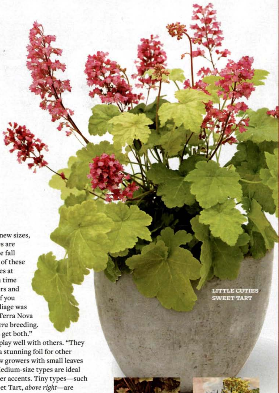
LITTLE CUTIES SWEET TART