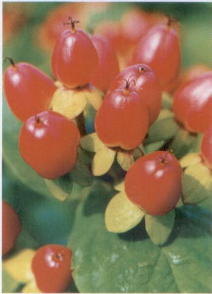
Hypericum , 'Mystical Sweetheart' (top), 'Mystical Red Star' (bottom) from Novalis.

the run who don't have time to spray). Currently there are three blossom colors: Oso Easy™ Peachy Cream, double blossoms that emerge peach and transform to cream; Oso Easy™ Paprika, red-orange single blooms with a bright yellow center; and Oso Easy™ Fragrant Spreader, a bush that spreads more than the other two with fragrant single pink flowers.