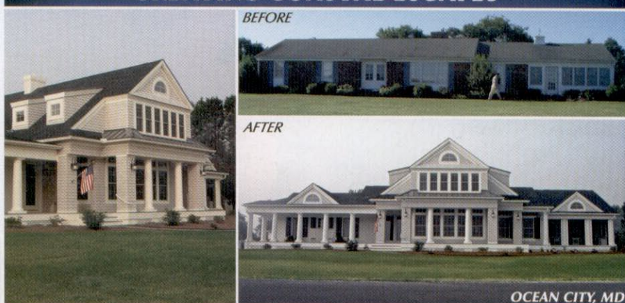
OCEAN CITY, MD