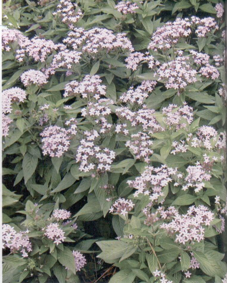
ABOVE: Pentas lanceolata 'Northern Lights Lavender,' from Ernst Benary of America. LEFT AND BELOW: Thai Delight Caladiums 'Notus Lotus' (left) and 'East Meets West' (below) from Hines Horticulture.