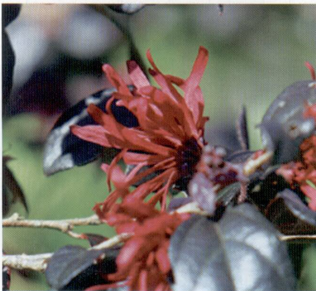
Loropetalum chinense 'Ever Red Sunset' from Monrovia.

feet. However, since the introduction of compact cultivars and the advent of global warming, I have convinced myself to try the most recent introduction, Loropetalum chinense 'Chang Nian Hong'. This cultivar grows six feet high and wide, produces intense dark red flowers in early spring, and maintains a very dark burgundy foliage color throughout the year. As a member of the witch hazel family, the flowers are strap-like, for which Monrovia, a wholesale grower, has named the cultivar Ever Red Sunset™ Fringe Flower. You also may find these sold as Ever Red™ Loropetalum in the Glowing Horizons™ series of the Gardener's Confidence® Collection, grown by McCorkle Nurseries in Georgia. There are other cultivars with flower colors in shades of red and pink, but this is the first with the darkest red flowers.