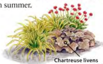
Chartreuse livens the subtle leaves of 'Brownies'.

4 'BROWNIES' What 'Brownies' lacks in sizzle, it more than makes up for in sheer size. It can reach 12 to 18 inches tall and 24 to 36 inches wide! The huge crinkled chocolate-brown leaves with a purple-red reverse look great contrasted with the chartreuse grass below. Cream-white flowers rise above the coral bells' huge leaves in summer.