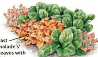
Contrast 'Marmalade's' frilly leaves with bold foliage.

8 'MARMALADE' Heavily ruffled amber, peach and bronze coral bells have been around for a while. But at 6 to 10 inches tall and 8 to 12 inches wide, 'Marmalade' is a much more vigorous cultivar. Pair it with bold leaves, as I've done below. As a bonus, tiny red-brown flowers open on 18-inch stems in late spring.