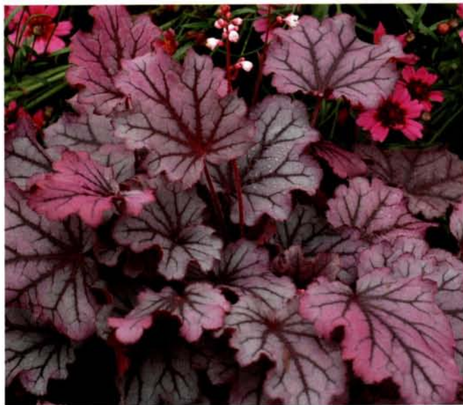
Heuchera 'Sugar Berry'