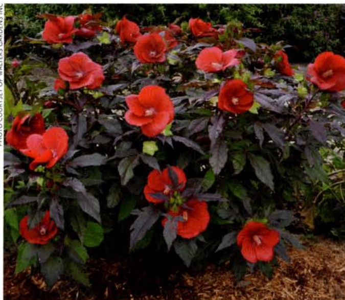
'Midnight Marvel' hibiscus