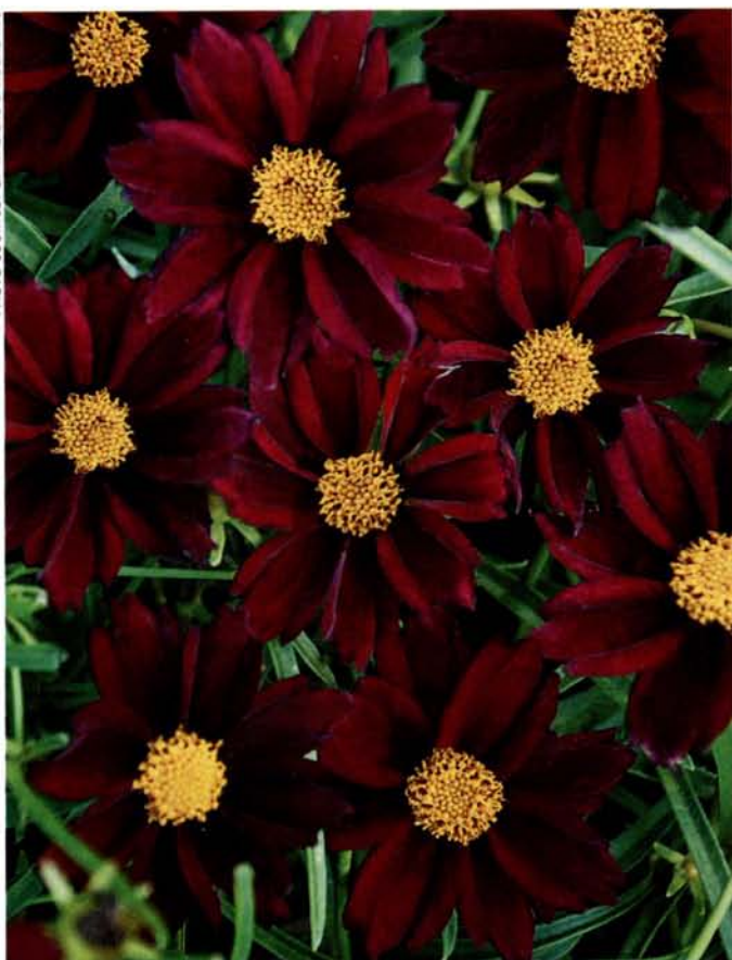
Coreopsis 'Mercury Rising'

ing, season after season. Flowers are a deep orange-red and last from mid-April into May. Be sure to plant these in a spot with good drainage. Full sun. Zone 3.