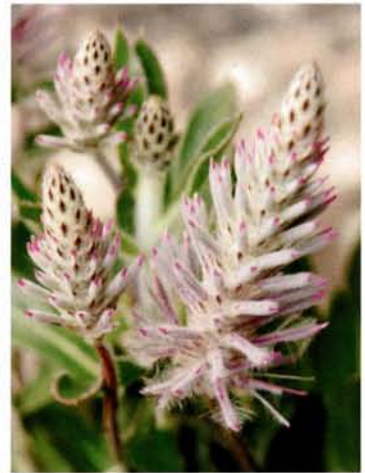
Above: Acer palmatum 'Ryusen.' Center column (top to bottom): Dyckia hybrid 'Burgundy Ice,' Roscoea Spice Island, Portulaca molokiniensis Maraca. Right column (top to bottom): Kalanchoe synsepala Gremlin, Ptilotus hybrid Platinum Wallaby.