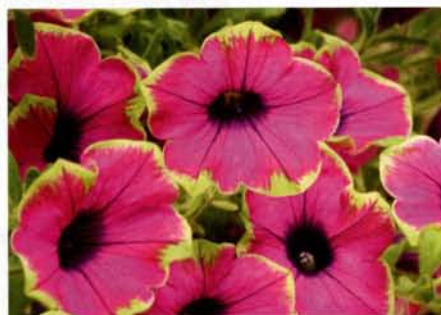
Left: Aloe variegata Gator, Right: Black Velvet and Supertunia Pretty Much Picasso petunias