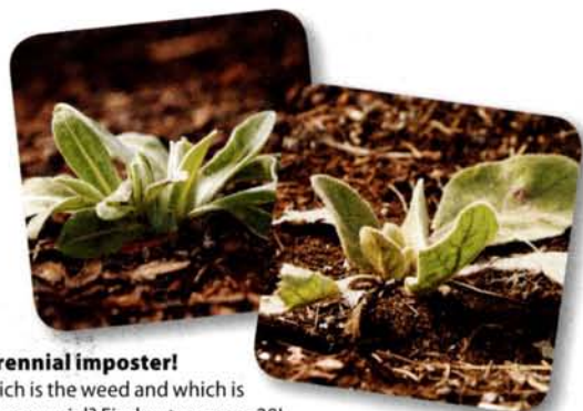
Perennial impostor! Which is the weed and which is the perennial? Find out on page 28!