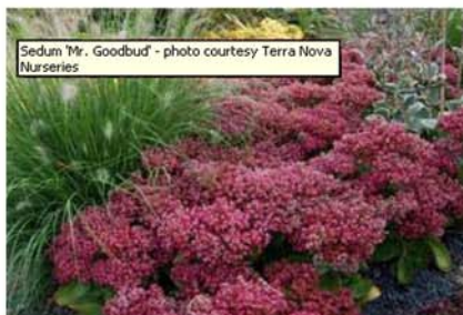
Sedum 'Mr. Goodbud'