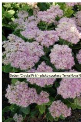
Sedum 'Crystal Pink'

Taller growing sedums are best planted at the edge of a border or walkway where they are able to remain somewhat upright. Reaching heights of about 16 inches, two upright and showy ones to consider are Sedum spectabile 'Crystal Pink' and Sedum spectabile 'Mr. Goodbud'. 'Crystal Pink' is a brand new sedum from Terra Nova Nurseries with the iciest pink heads you'll ever see. Large heads of the softest pink on shorter stems make an awesome combination with blue-leaved grasses or with echinacea. It is an improvement upon the traditional 'Autumn Joy' sedum because the blooms hold together stronger. Butterflies are attracted to it. 'Mr. Goodbud' has gained a lot of popularity among many gardeners. This dusky S. Spectabile has tight foliage and strongly contrasting colors between its light buds and dark mauve flowers. In 2006, it won the Royal Horticulture Society's Award of Merit.