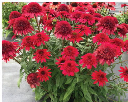
Echinacea SUNNY DAYS™ Ruby PPAF PBR AF