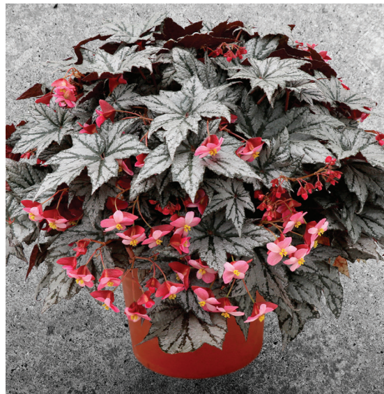
Begonia HOLIDAY™ 'New Year's Eve'