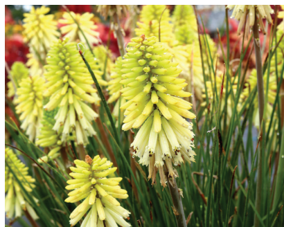
Kniphofia 'Poco Citron' PPAF PBR AF