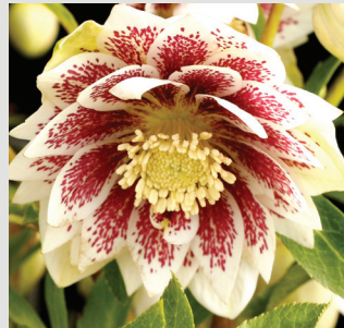
Helleborus NORTH STAR™ Ruby Heart