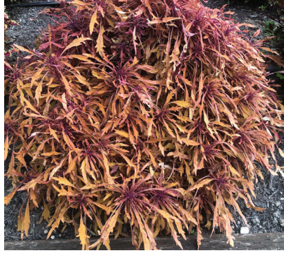
Coleus TERRA NOVA® 'Monkey Puzzle'