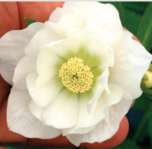
Helleborus NORTH STAR™ Crystalline