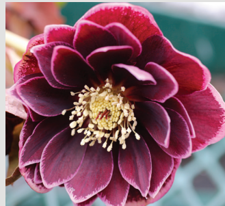
Helleborus NORTH STAR™ Plum