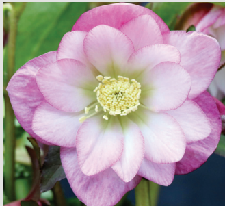
Helleborus NORTH STAR™ Pink