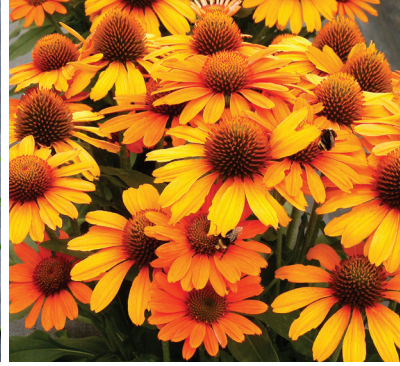
Echinacea PRIMA™ Saffron (TNECHPS) PPAF