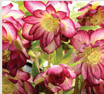
Helleborus NORTH STAR™ Garnet Frills