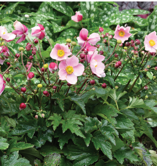
Anemone SATIN DOLL™ Blush PPAF