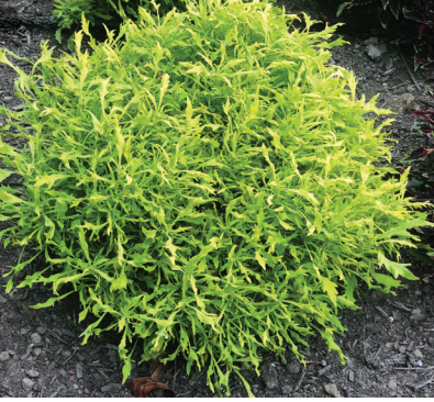
Coleus NOVA® 'Mad Medusa'