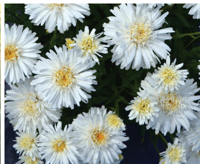
Leucanthemum 'Mt. Hood'