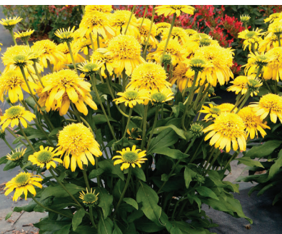
Echinacea SUNNY DAYS™ Lemon PPAF PBR AF