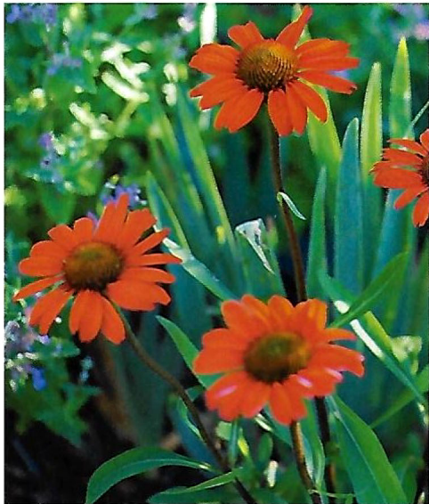
KISMET® INTENSE ORANGE CONEFLOWER Echinacea 'TNECHKIO'