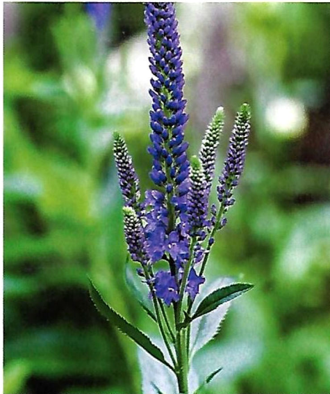
'MARIETTA' SPEEDWELL Veronica longifolia 'Marietta'

Intense Orange perfectly describes the almost glowing color of this coneflower. Red-orange buds open a very deep orange that becomes more muted over time. There's never any pink or salmon, as there can be with some oranges. I'm not sure if maintaining this plant with a true cutback or with just deadheading is best. There may be a point to do a cutback, but it is a heavy bloomer even without cutting. If you want to leave seeds for the birds in winter, quit removing spent blooms midseason. The color works well with blues in beds and bouquets.