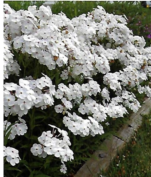
'MINNIE PEARL' PHLOX Phlox 'Minnie Pearl'

'Marietta' has beautiful blue to blue-violet spikes of flowers in early to late summer. The tall spikes attract bees and butterflies but are rabbit and deer resistant. Blue is always a highly sought-after color in the garden, and this one can complement about any color you want to pair it with. Mildew-resistant foliage adds to the appeal of this great garden performer, which makes a superb cut flower as well. To extend bloom time, cut back the flowers as they fade. Cutting individual stems can be tedious, so I often grab a handful of stalks and cut them all back at once to get a fuller reflush.