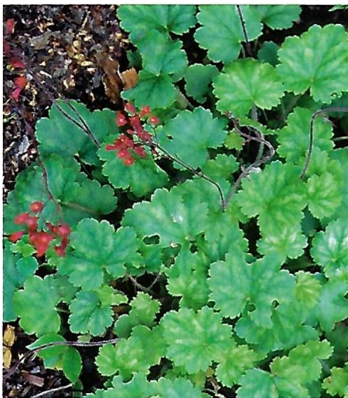
'RUBY BELLS' HEUCHERA Heuchera sanguinea 'Ruby Bells'

"HOW-DEE! I'm just so proud to be in your garden." I can hear 'Minnie Pearl' phlox saying that—and you will be proud to have her in your garden in return. In early summer the plants are covered in white flowers, sometimes with a hint of pink to them. Flowering is profuse, and plenty of pollinators and butterflies will visit. Don't hesitate to cut some flowers for a vase; there will be plenty. The deep green foliage is highly mildew resistant, but if you cut the plants back after flowering you will be rewarded with a second bloom in late summer or fall. Plant 'Minnie Pearl' in full sun for the best blooms.