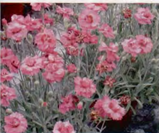
Dianthus, Twilight Star

ters Gardens has stunning sky blue flowers with the slightest hint of pink. The color of the bee ranges from black to brown to blue striped. The foliage tends to be a bit lighter green than others in the series.