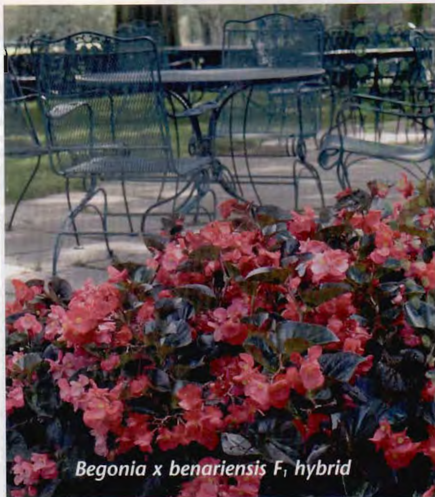
Begonia x benariensis F 1 hybrid