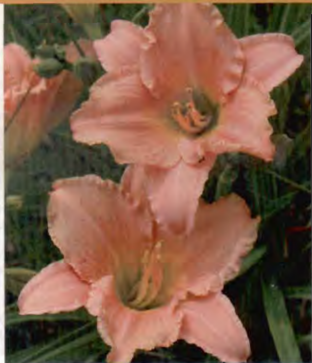
Daylily, Toy Cameo

Terra Nova Nurseries introduces three new varieties. 'Pineapple Pie' forms a low-growing mound with numerous red-eyed, golden-yellow flow-