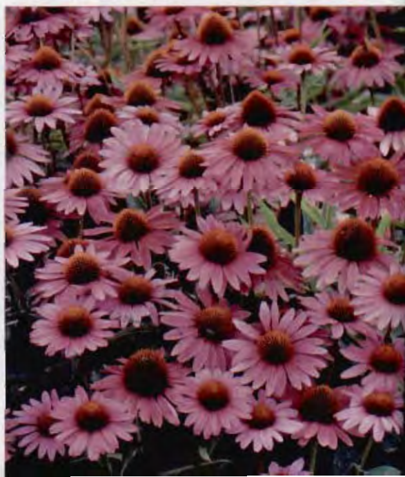
Echinacea, Magnus Superior

The Glow series has a ground-hugging, tight plant habit and produces a myriad of small, honey scented flowers