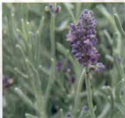
Lavandula, Oxford Gem

'Oxford Gem' from Blooms of Bressingham features uniform, compact mounding plants and vigorous silver-green foliage that forms dense