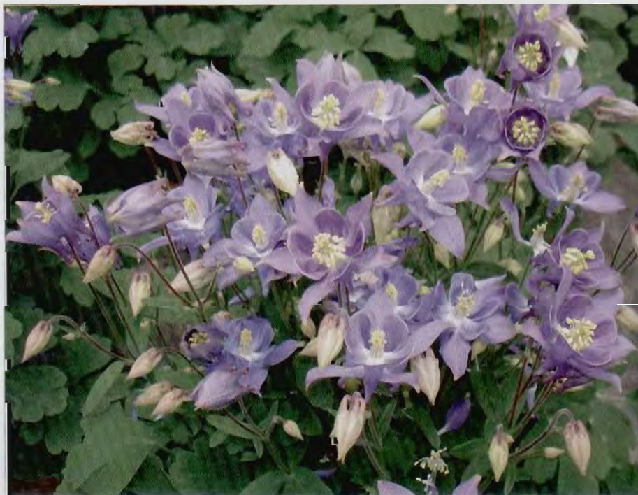
Aquilegia, Winky Early Sky Blue

Thompson & Morgan has three new varieties. 'Rhubarb & Custard' has masses of bright red and yellow flowers and a neat, compact habit. It reaches a final garden height of 8 inches. 'Sunshine' has fully double pastel yellow flowers with long, 2-inch spurs on the back of each flower. It grows to 2 feet tall. 'Double Pleat Blackberry' has fully double pleated flowers in contrasting dark purple and white.