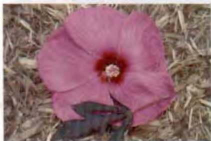
Hibiscus, Kui Nuku

Fleming's Flower Fields introduces its Fleming Dwarf series. These hybrids reach 2½- to 3-feet tall and require no growth regulators. They are hardy to -30°F and bloom from top to bottom of