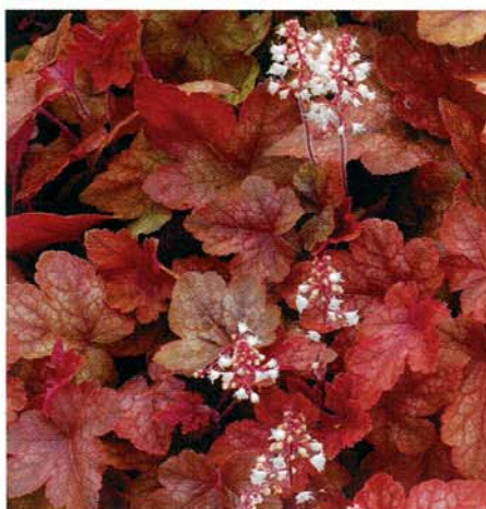
'Redstone Falls' heucherella