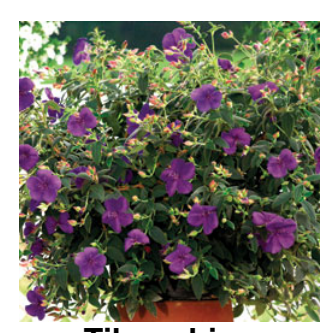
Tibouchina GGG International Inc