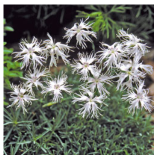
Dianthus Jelitto Perenial Seeds