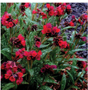
Pulmonaria Terra Nova Nurseries, Inc.