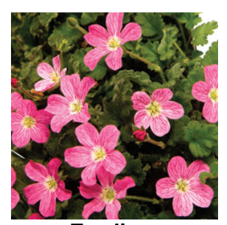
Erodium Jaldety Nursery