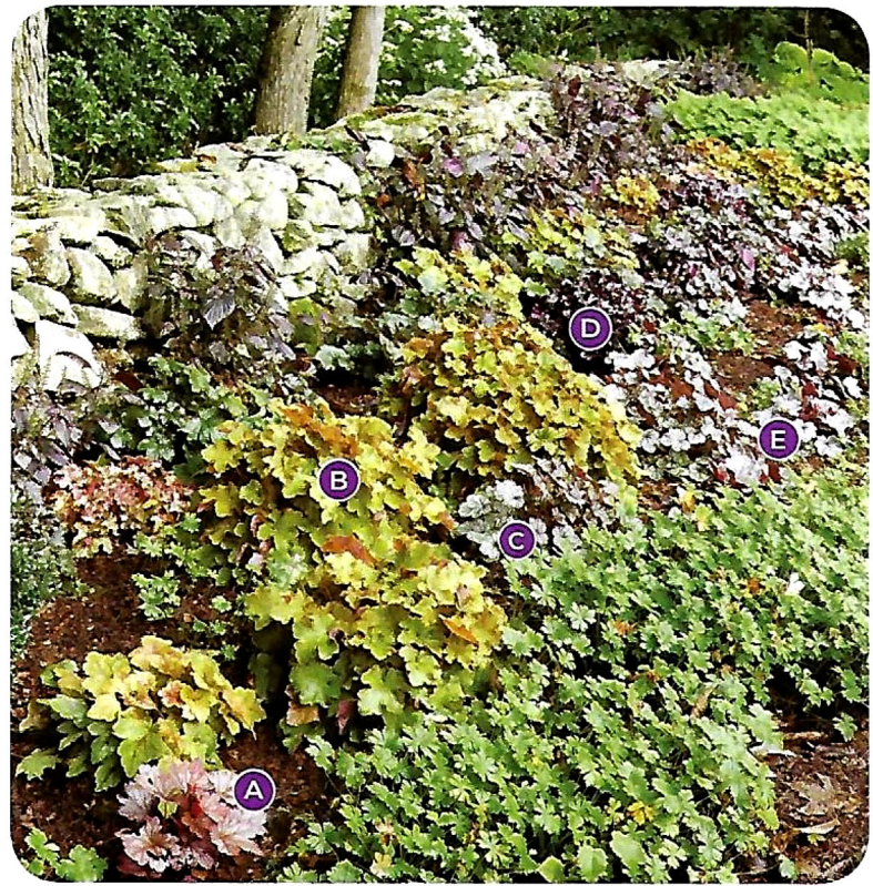
3 | Fantastic foliage Don't limit yourself to just one type of coral bells — there are so many different foliage colors you can mix together to create a beautiful tapestry like this one. 'Georgia Peach' (A), 'Caramel' (B), 'Silver Streak' (C), 'Dark Secret' (D) and 'Stainless Steel' (E) are just a few in this border.