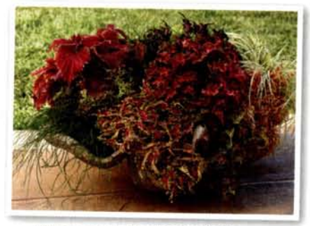
We love coleus! Meet some of our favorite new varieties and learn handy tips for designing with them on page 16.

ON THE BACK COVER: Ballad dwarf sunflower ( Helianthus annuus ).