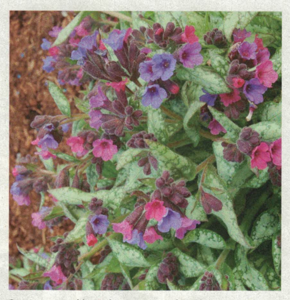
Some genera like Pulmonaria used to show an 85% infection rate amongst the hybrid seedlings, after five years of breeding, this is down to 5%. Pictured is Pulmonaria 'High Contrast,' a Terra Nova variety bred to be resistant to powdery mildew.