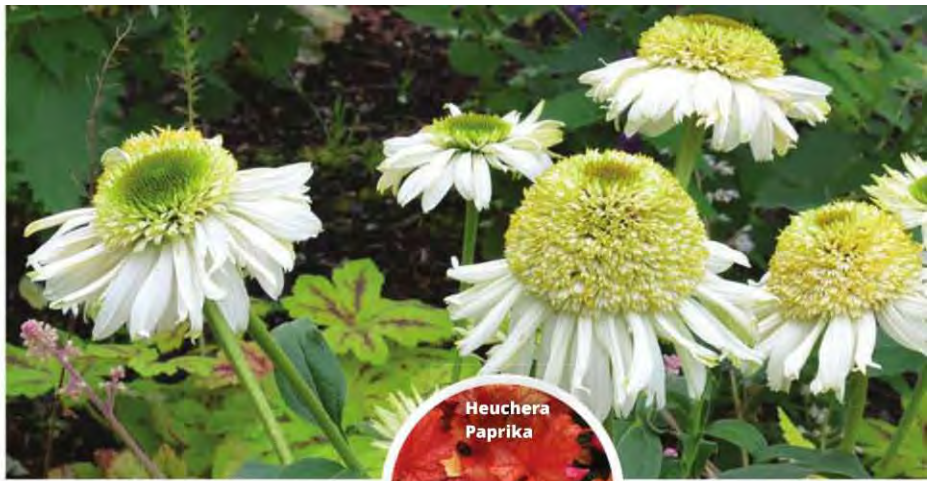
Echinacea Vanilla Cupcake

Eucomis 'Glow Sticks' features glowing foliage that changes from coppery-rose to burnished gold. The foliage is very wavy when grown in full sun. Upright and