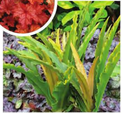
Eucomis Glow Sticks

TERRA NOVA NURSERIES VARIETIES COURTESY OF TERRA NOVA