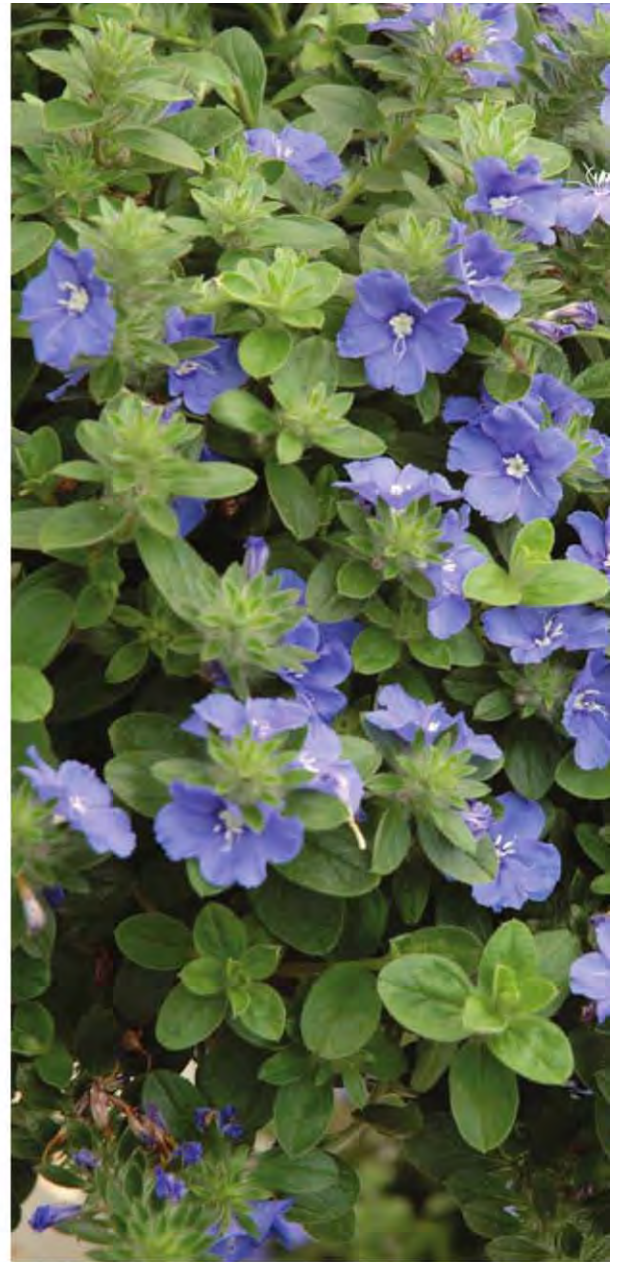
Evolvulus Blue My Mind

The Dallas Arboretum Trial Program takes data on 7,000-plus annuals, perennials, woodies, grasses and trees each year, looking for the toughest of the tough. North Texas is a brutal climate that can swing from one extreme to another; six months of drought is usually followed by a month of flooding. Many of the arboretum's trials focus on heat tolerance and ability to withstand low water requirements, because Texas is experiencing water restrictions like other states. We highlight some great drought-tolerant contenders here.