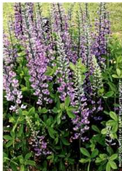
Baptisia Blue Towers

This striking sedum was introduced in a limited way last year but will be widely available this season, so I'm calling it a new perennial for 2014. Part of Terra Nova Nurseries Touchdown™ series, this sedum is a vigorous grower with unusual red stems and red-brown foliage that looks almost purple. Grows to 8 inches tall and 11 inches wide. Drought tolerant. Full sun. Zone 4.