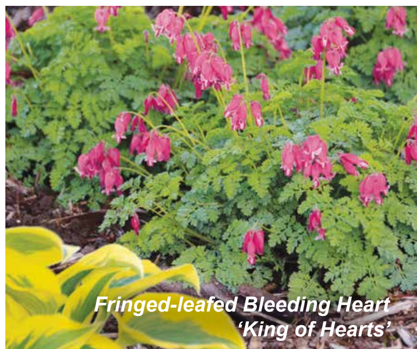
Fringed-leafed Bleeding Heart 'King of Hearts'

The long-blooming cousin to the old-fashioned bleeding heart, the fringed-leafed bleeding hearts bloom for months on end. Small pink-to-red heart-shaped flowers dangle over fern-like foliage beginning in June. Plants need adequate moisture to continue blooming all summer. These small plants are perfect for the front of the garden or tucked in between rocks. The regal ' King of Hearts ' displays lipstick pink blossoms that are larger in size and quantity than other varieties. Other summer bloomers: hosta, coral bells, fairy candles, turtlehead.