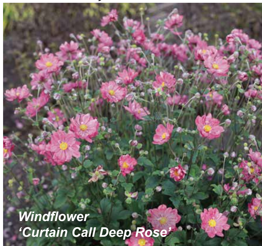
Windflower 'Curtain Call Deep Rose'

Windflowers ( Anemone hybrid ) produce countless flowers at a time when most plants are ready to call it a day. While the classic tall varieties create enticing displays, their large size, usually growing 3' tall or more, limit their function in the garden. The petite ' Curtain Call Deep Rose ' features loads of large vibrant pink flowers while only growing about 18" tall. Another dwarf, 'Snow Angel', illuminates the garden with hundreds of bright white blossoms. Windflowers provide a late-season nectar source for pollinators, and their long-lasting flowers look beautiful in fall bouquets. Other late-season bloomers: woodland aster, toad lily.