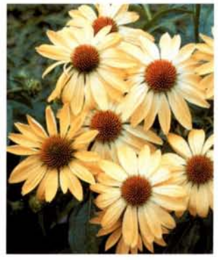
Big Sky" 'Sunrise' Butter-yellow flowers fade to cream; 24 to 36 in. tall, 18 to 24 in. wide; cold zones 4 to 9, heat zones 9 to 1