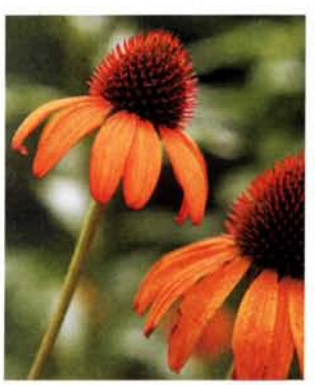
'Tiki Torch' Pumpkin-orange flowers in summer; 24 to 36 in. tall, 18 to 24 in. wide; cold zones 3 to 9, heat zones 9 to 1