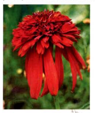
'Hot Papaya' Double red-brange flowers are fragrant; 30 to 36 in. tall, 24 to 30 in. wide; cold zones 4 to 9, heat zones 9 to 1

Double flowers, orange flowers, yellow flowers — what's come over good, old-fashioned coneflowers? Exciting new colors and shapes take this dependable favorite into the future. But which ones should you buy? Check out these three cultivars that get top marks.