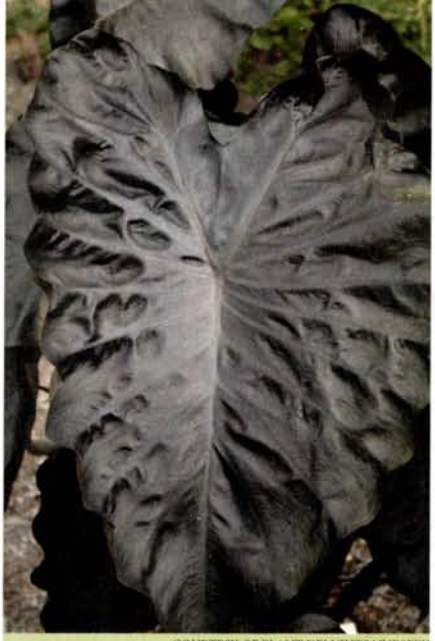
Colocasia esculenta 'Black Coral'

For more information: Keith Friend; sales@vermontorganics.com