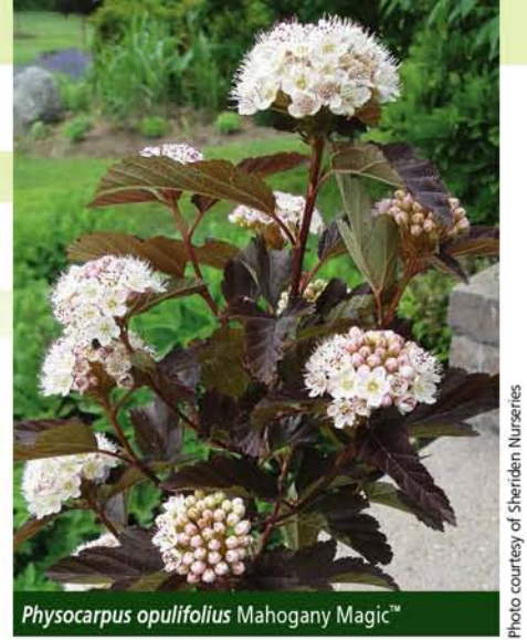
Physocarpus opulifolius Mahogany Magic™

Mail: P.O. Box 157, Lakeshore West P.O., Oakville, Ont., Canada L6K 0A4 Office & Warehouse: 5204 Trafalgar Rd., Milton, Ont., Canada L0P 1E0 Phone (905) 878-4244 --Fax (905) 878-7888 Sales 1-888-769-TIMM (8466) www.timmenterprises.com sales@timmenterprises.com