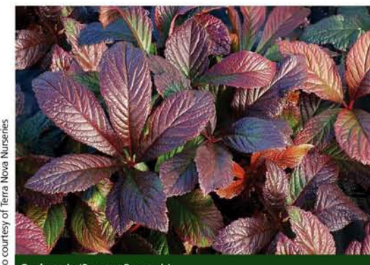
Rodgersia 'Bronze Peacock'

Ornamental features: The darkest foliage of any rodgersia; the leaves are thick, glossy, indented and make a great sculptural addition to your woodland garden; large trusses of tiny pink flowers emerge in late spring above the mound; in spring, the huge bronze leaves emerge like a peacock's tail; compact habit stays within bounds of container or garden