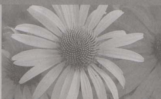
Echinacea "Mac 'n' Cheese" refuses to fade. Right, Hellebore "Mellow Yellow" is another must-have plant.

Hydrangea "All Summer Beauty." This variety has more flowers over a longer period of time than its popular cousin, "Endless Summer." homesteadgardens.com. 800-300-5631