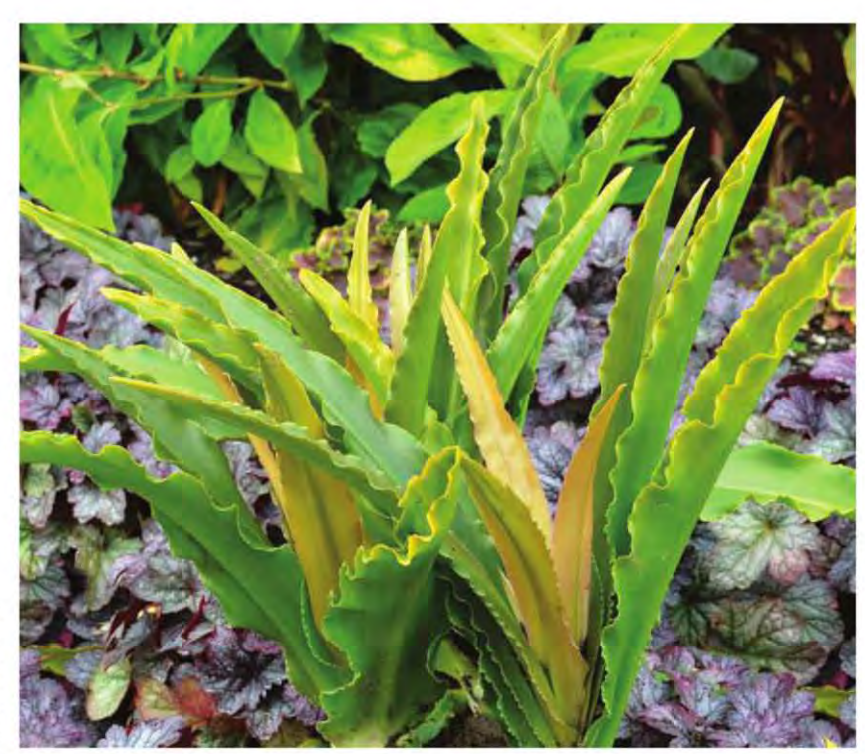
Eucomis 'Glow Sticks'

Terra Nova's Heuchera 'Paprika' touts glowing coral foliage in the spring and veiled cherry-coral foliage in summer and fall. Medium-large leaves on a medium-sized plant feature 8 in. foliage height, 16 in. foliage spread, and 12 in. flowering height. For zones 4 to 9, part shade (full sun in the Pacific Northwest). &