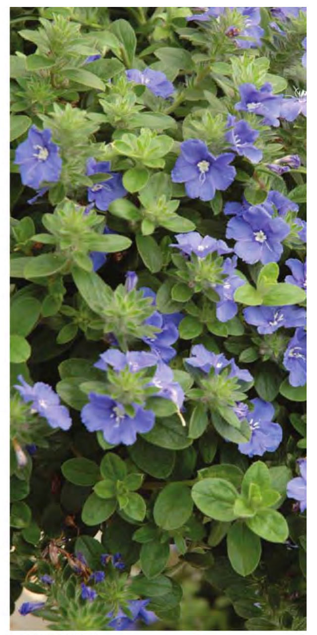
Evolvulus Blue My Mind

he Dallas Arboretum Trial Program takes data on 7,000-plus annuals, perennials, woodies, grasses and trees each year, looking for the toughest of the tough. North Texas is a brutal climate that can swing from one extreme to another; six months of drought is usually followed by a month of flooding. Many of the arboretum's trials focus on heat tolerance and ability to withstand low water requirements, because Texas is experiencing water restrictions like other states. We highlight some great drought-tolerant contenders here.