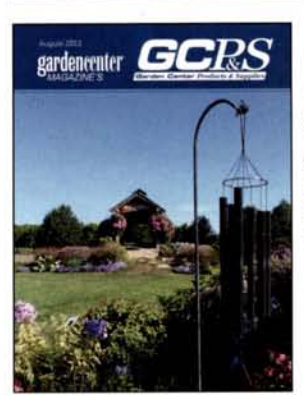
GCP&S Your guide to choosing the best products for your garden center on page 35