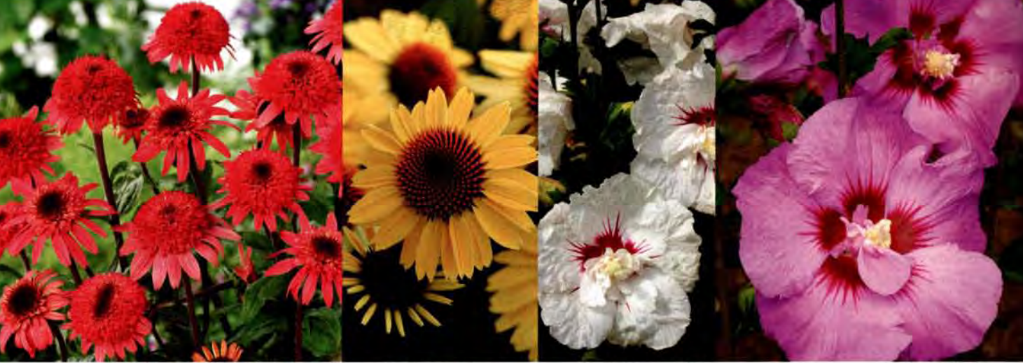
Echinacea 'Raspberry Truffle '

New Tropical 56 • Intensia phlox 60 • Allan Armitage 62