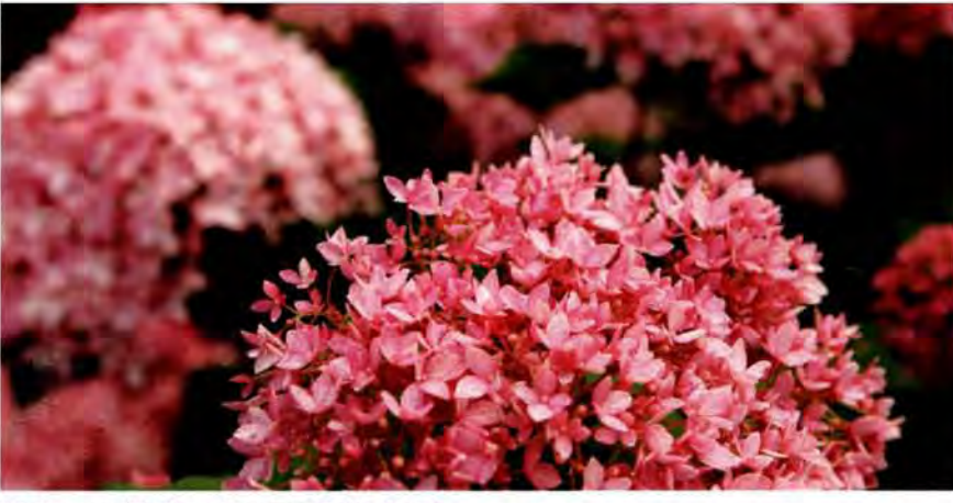
Hydrangea 'Endless Summer Bella Anna'

"Syngenta is looking for perennial crops that flower the first year, rather than needing vernalization or overwintering," says breeder Har Stemkins, who is based in