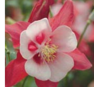
'Songbird Cardinal Improved'