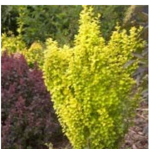
'Sunjoy Gold Pillar'

'Belleza White Evol. Improved' Let's Dance