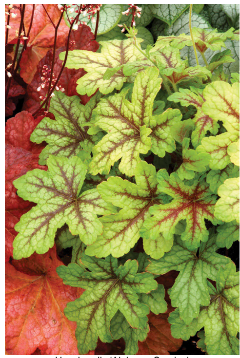
Heucherella 'Alabama Sunrise