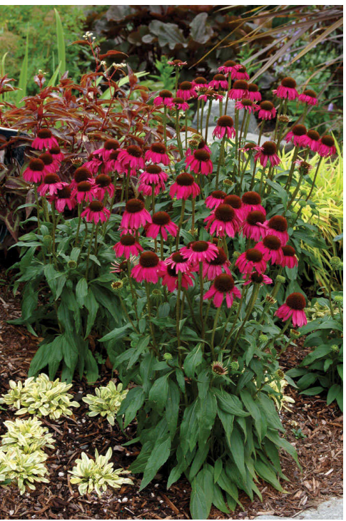
Echinacea 'Raspberry Tart'