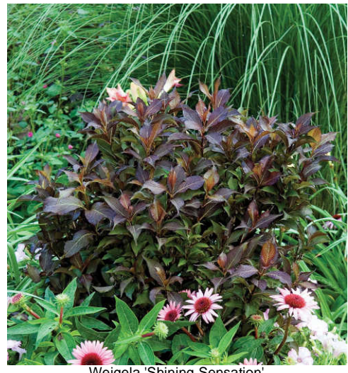
Weigela 'Shining Sensation

"Mystical Beauty' allows gardeners to enjoy the same hypericum plants that were bred exclusively for the cut-flower industry," says Guy. "Beautiful, salmon-pink colored fruits on perfectly branched stems are lovely in the garden or in long-lasting bouquets." A large, red-berried form, 'Mystical Beauty' is also exclusively available from Novalis in 2008. This plant will fill the fall garden with interest and floral arrangements with lovely colored hips and bright yellow flowers in spring. Hypericum can be used as a specimen plant or in masses. 'Mystical Beauty' is rust-resistant