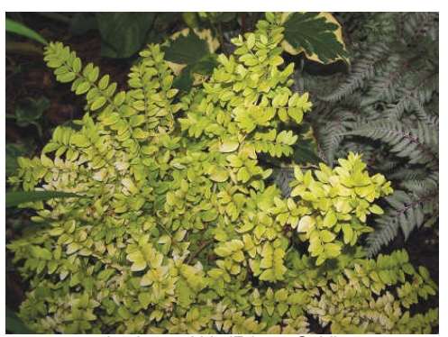
Lonicera nitida 'Edmee Gold