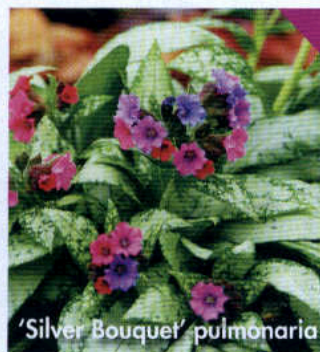
'Silver Bouquet' pulmonaria