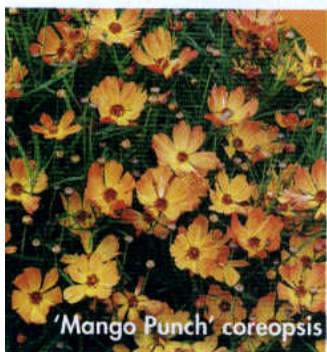
'Mango Punch' coreopsis