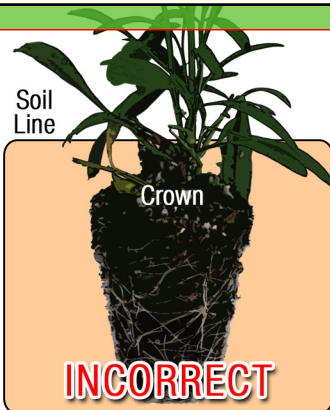
Do NOT bury the crown of the plug

Day Length for Flowering: Quantitative Long Day