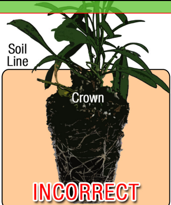
Do NOT bury the crown of the plug